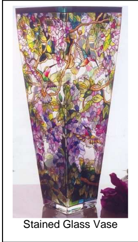
Stained Glass Vase

The Miracle Vase is perfect for catering, events, parties & weddings, funerals & the cemetery, hospitals, boats, patios, poolside terraces and offices. Made of flexible, unbreakable PVC, they fold flat for shipping and storage. When the miracle vase is filled with water, it takes and holds its shape. The vase can be cut to suit any size arrangement, but comes in two sizes – 5" high $5 and 14" high $9. Choose from pink, blue, green, mauve and clear. Very simple, yet very handy. Best of all, you can't tell it's not glass! Also upstairs at Campbell's Store.