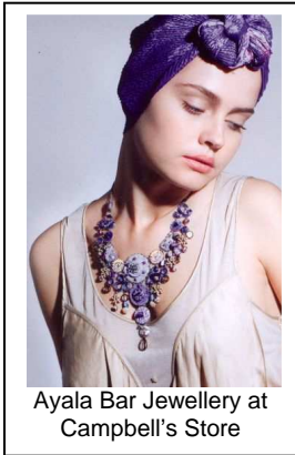
Ayala Bar Jewellery at Campbell's Store

Starting off with a stand at the local craft market of Tel Aviv, it was not long until demand for Ayala Bar's jewellery grew. Thus, Ayala Bar the brand – was born. She is now one of Israel's most prominent jewellery designer's and exporters. With a background in costume design, a keen eye for detail and a passion for all varieties of materials, contrasts and colours, Ayala bar creates unique wearable art designed to accentuate a woman's femininity. She now has a 600 sqm studio near Tel Aviv with a team of over 60 artisans working on weaving, setting and assembling each design. It's a labour intensive process that requires a great degree of skill.